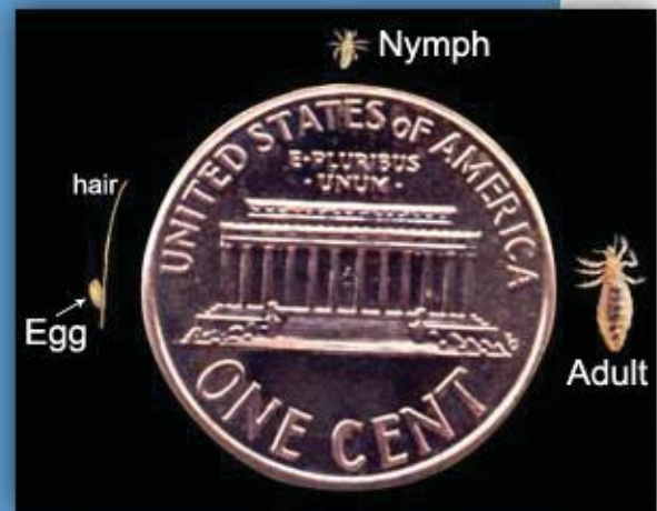
Size comparison of head lice life stages.